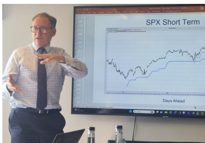
Face to Face